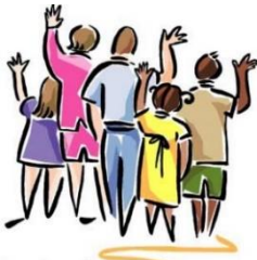
Say Goodbye to Our Pastor and Family

Time is quickly approaching to say goodbye to our wonderful Pastor and his family. There will be several opportunities for you to offer them well wishes.